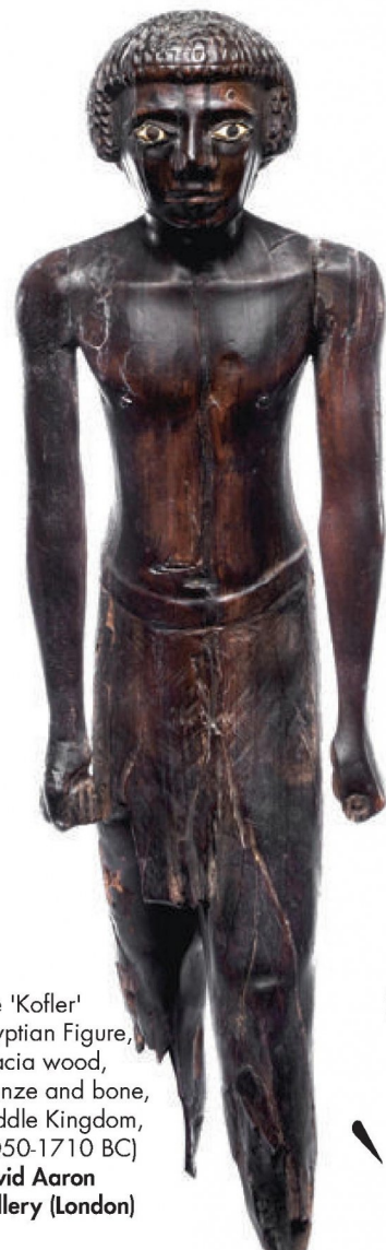
The 'Kofler' Egyptian Figure, acacia wood, bronze and bone, Middle Kingdom, (2050-1710 BC) David Aaron Gallery (London)